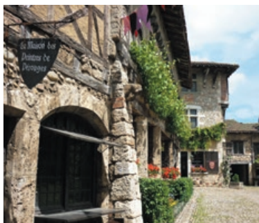
PÉROUGES (20 KM)