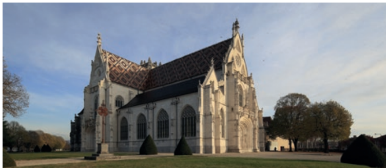
BOURG-EN-BRESSE (30 KM)