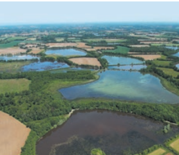
LES ÉTANGS DE LA DOMBES