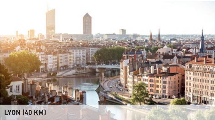
LYON (40 KM)