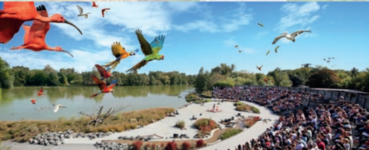
THE FLYING BIRDS SHOW!