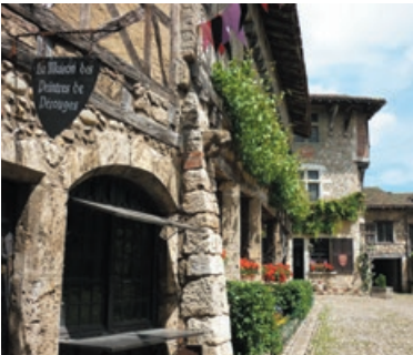
PÉROUGES (20 KM)