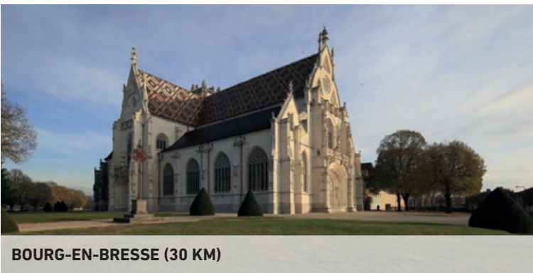
BOURG-EN-BRESSE (30 KM)

We advice you to book either at the restaurant or the reception.