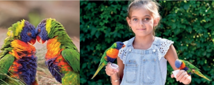
FEED MORE THAN 300 LORIES YOURSELF!