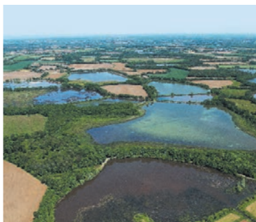
LES ÉTANGS DE LA DOMBES