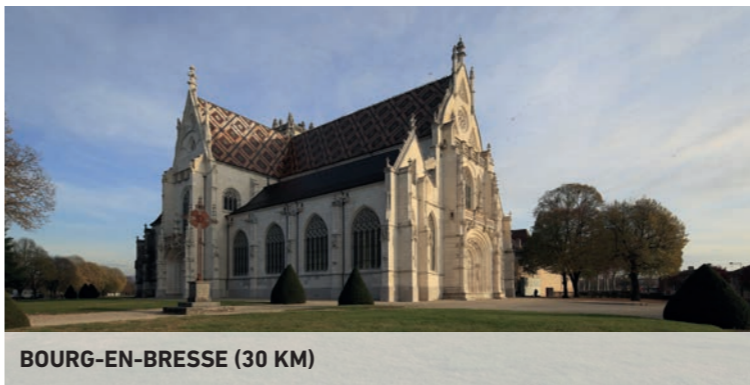
BOURG-EN-BRESSE (30 KM)

We advice you to book either at the restaurant or the reception.