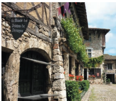
PÉROUGES (20 KM)