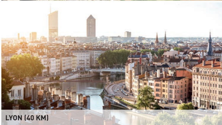
LYON (40 KM)